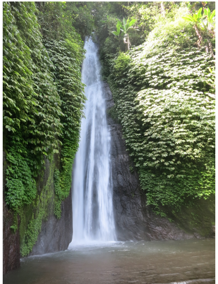
Red Coral Waterfall

There are two nice waterfalls which you can easily reach by foot from Lesong Hotel. The first is called Melanting, the second Red Coral (Red Coral is a tourist name, the original name is Tanah Barak). Walking distance to each of them is about 2h if you go easy. There is a small entrance fee to each of the waterfalls. There is also a hotel called Melanting, so don't get confused. If you prefer to walk one way only, we can of course arrange a pick up for you.